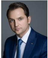
SEBASTIAN IOAN BURDUJA Minister Ministry of Energy, Romania