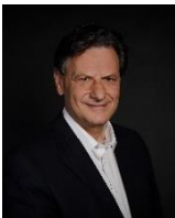
THEODORE SKYLAKAKIS Minister Ministry of Environment & Energy, Greece