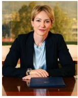
ALEXANDRA SDOUKOU Deputy Minister Ministry of Environment and Energy, Greece