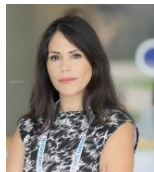
JANET SHALOM Head, Division for International Relations and Foreign Policy, Ministry of Energy and Infrastructure, Israel