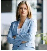
SANJA BOZHINOVSKA Minister Ministry of Energy, Mining and Mineral Resources, North Macedonia