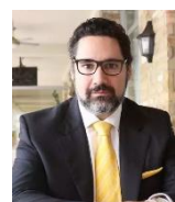
Moderator: PROF. THEODOROS TSAKIRIS Coordinator for International Energy Policy, Office of the Minister for Environment and Energy, Greece