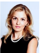
Moderator: VALBONA ZENELI Nonresident Senior Fellow Europe Center, Scowcroft Center for Strategy and Security, Transatlantic Security Initiative, Atlantic Council