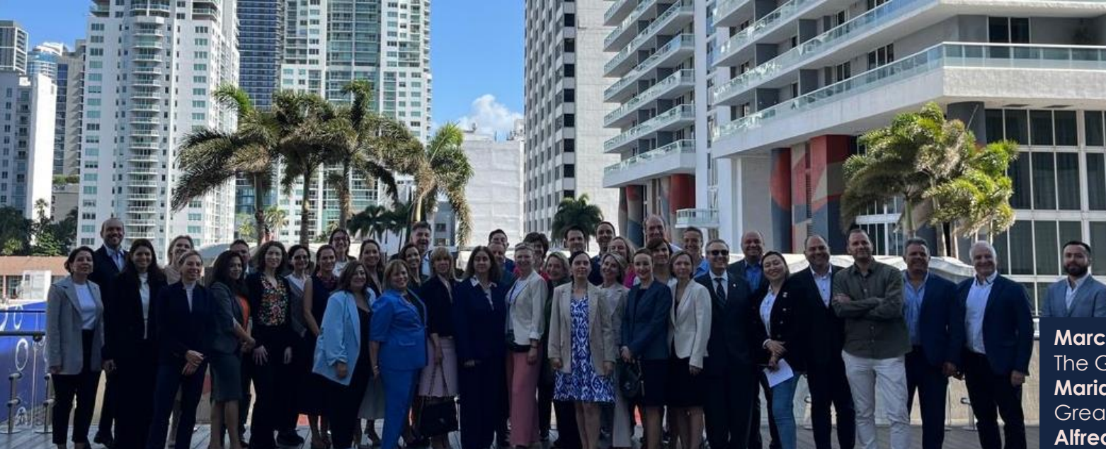
ACE group photo with The Greater Miami Chamber of Commerce executives