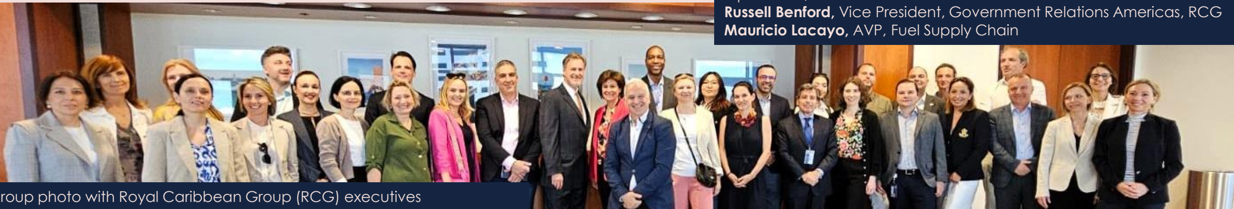
ACE group photo with Royal Caribbean Group (RCG) executives