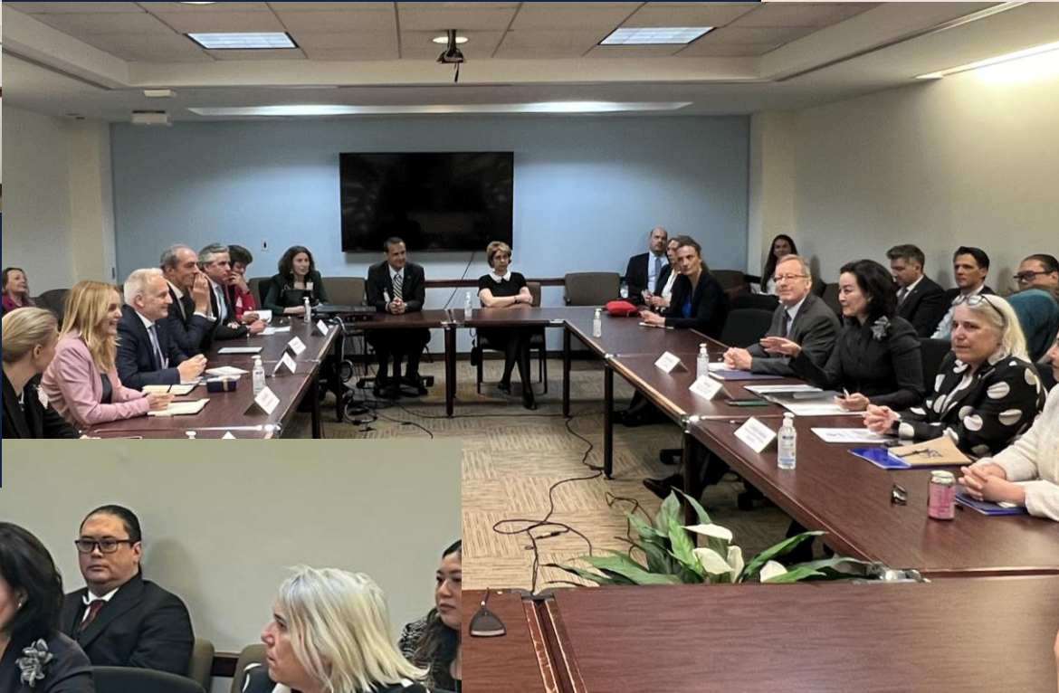
ACE group at U.S. Department of State offices