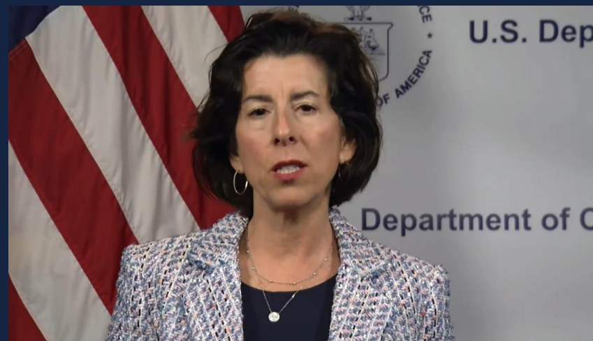
Gina Raimondo , U.S. Secretary of Commerce