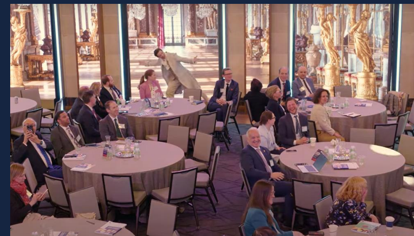
Transatlantic Business Works Summit