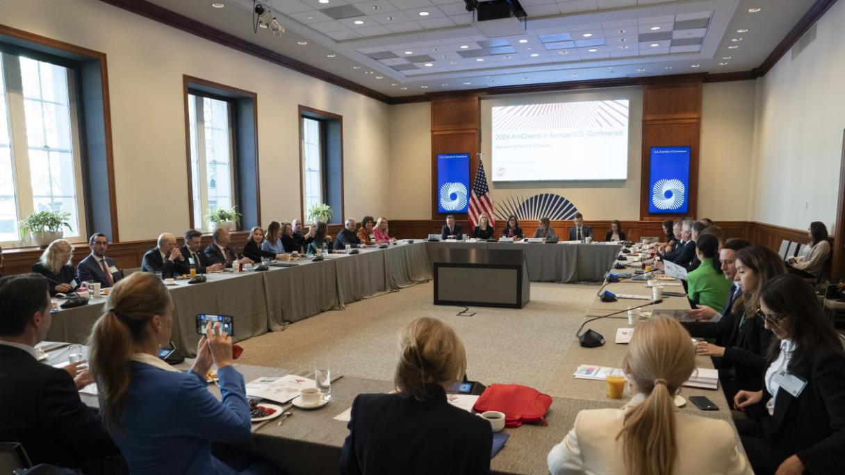
ACE group at U.S. Chamber of Commerce offices